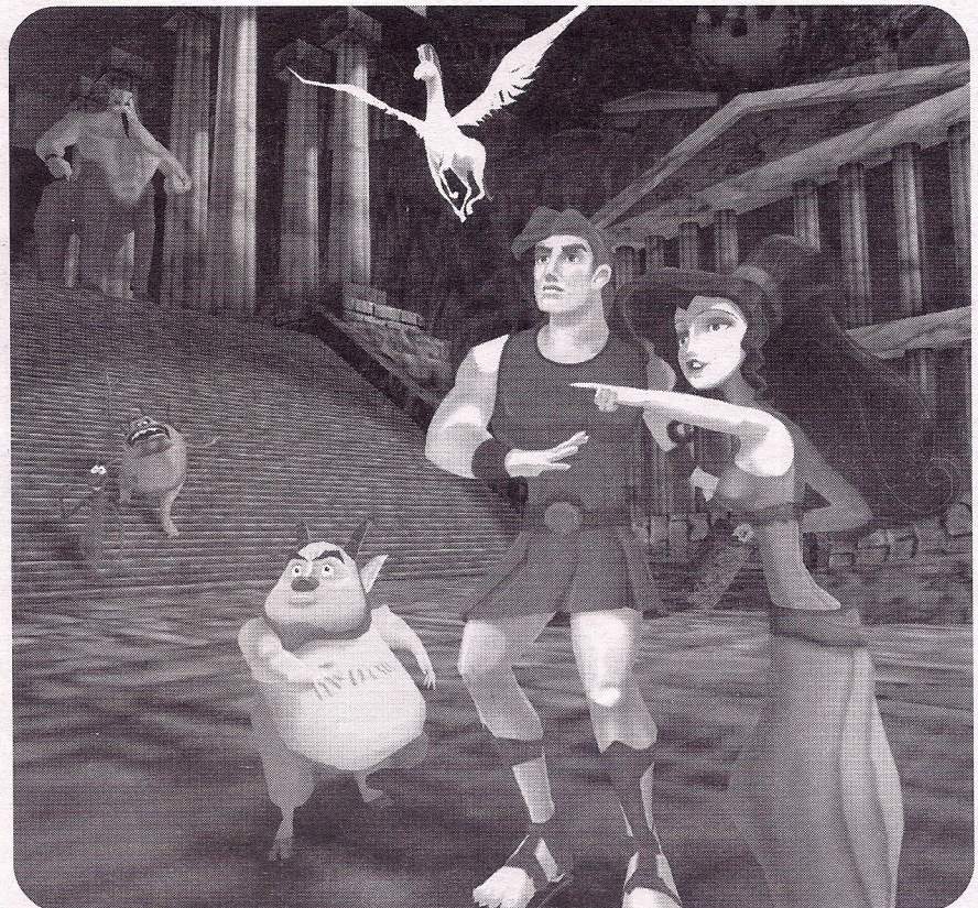
HERCULES IN THE UNDERWORLD Help Hercules and his friends battle the evil Hades.